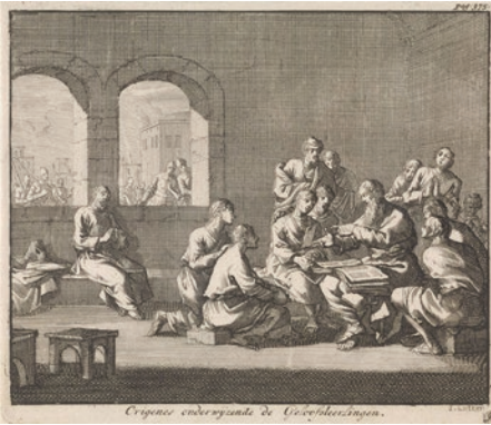
Dutch illustration by Jan Luyken (1700), showing Origen teaching his students

the original Greek acts of the Second Council are lost. The records that do exist make no mention of the debate over Origen. In any event, the Council of Constantinople didn't actually condemn the concept of reincarnation or rebirth per se. 19 Its concern was to proclaim the doctrine of special creation.