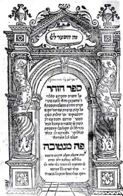
Title page of the first printed edition of the Zohar, Mantua, 1558.

Belief in reincarnation was common among Palestinian Jews at the time of Jesus, namely, the Essenes, 7 the Nazarenes 8 and the Pharisees, 9 and references to reincarnation abound in the classic Kabbalistic text, the Zohar (the Book of Splendour).