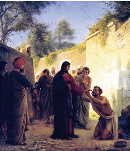
Healing of the Blind Man by Jesus Christ Carl Bloch

Jesus answered, 'Neither this man nor his parents sinned. But it happened so that the works of God might be displayed in him.' 35